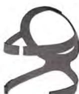
XL Headgear CARA/CARA Full Face without headgear clips WM 25338