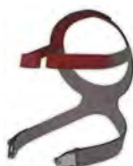
Headgear CARA Full Face incl. headgear clips WM 25243