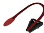
Quick-release cord CARA Full Face WM 25623

You will find more information about our therapy solutions, accessories and mask systems at loewensteinmedical.com