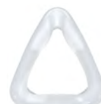
Mask cushion CARA Full Face Size S: WM 25601 Size M: WM 25602 Size L: WM 25603