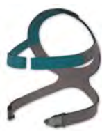
Headgear CARA incl. headgear clips XS: WM 25191 Standard: WM 25192