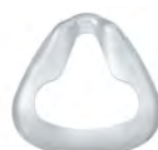
Mask cushion CARA Size XS: WM 25189 Size S/M: WM 25238 Size M/L: WM 25239